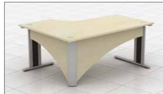
Perforated Modesty Panel