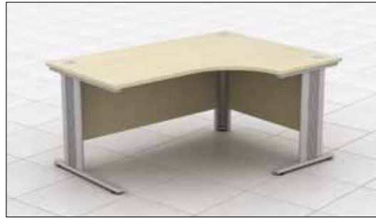
Straight Modesty Panel

Qudos desking is available with a choice of 4 modesty panels